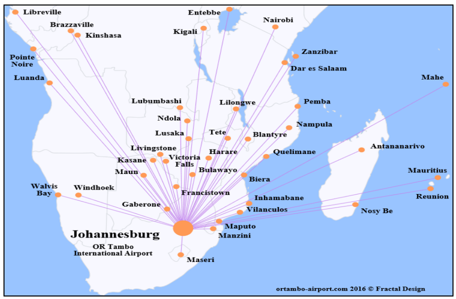
Figure 2. Route map of regional flights in southern Africa

Air transport plays a vital role in global, regional and national economies (Campbell, 2014). The World Travel and Tourism Council (WTTC, 2016) reports that air transport generates a total of 32 million jobs globally, through direct, indirect, induced and catalytic impacts. According to Price Waterhouse and Coopers (PWC, 2016) aviation's global economic impact (direct, indirect, induced and catalytic) is estimated at US$ 3.560 billion, equivalent to 7.5% of world Gross Domestic Product (GDP). The airline industry therefore plays a significant role in the economy as a modern day engine of economic growth (WTTC, 2016). The airline industry is regarded as one of the largest sectors in Western economies. It is one of the largest private sector employers in the United States of America (USA), directly employing nearly 255 000 full- and part-time workers in 2015 (IATA, 2016). Including indirect, induced, and enabled impacts, general aviation, in total, supported 1.1 million jobs and US$219 billion in output (IATA, 2016). The airline industry also generated US$69 billion in labour income (including wages and salaries and benefits as well as proprietors' income) and contributed US$109 billion to US GDP in 2015 (PWC, 2016). Overall, total GDP impact attributable to general aviation amounted to US$346 per person in the United States in 2015 (IATA, 2016).