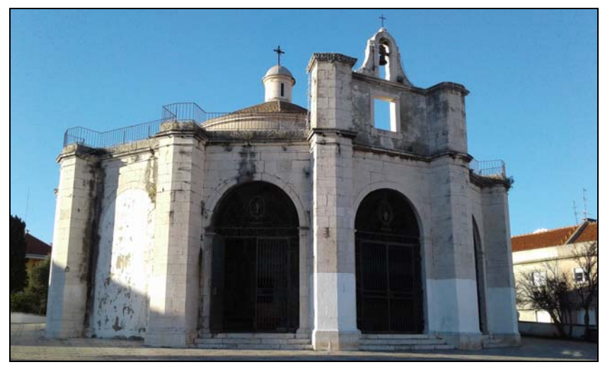
Figure 1. The Chapel of Santo Amaro

spherical dome and lantern. The sacristy is contiguous to the chancel. Held on January 15, Saint Amaro pilgrimage was one of the busiest in the city, and took place for the last time in 1911. With the advent of the Republic in 1910, the chapel had been abandoned and looted, even serving as charcoal. In 1927, it was delivered to the Brotherhood of the Blessed Sacrament, and the following year the space was rehabilitated for worship<sup>9</sup>.