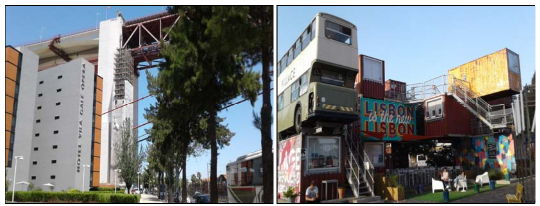
Figure 4 . Centro Interpretativo da Ponte 25 de Abril (under construction)