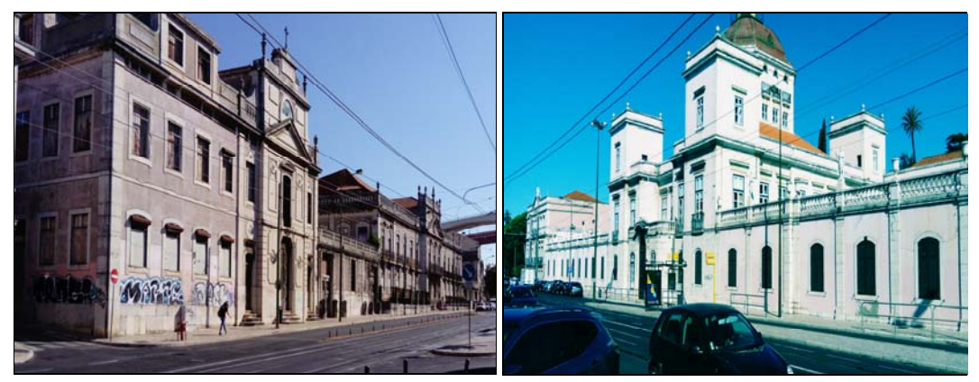
Figure 2. Palace of Ribeira Grande

But before arriving there our attention goes to Palace of Ribeira Grande (nr. 66) (Figure 2), built in the early years of the 18<sup>th</sup> century, by the Marquis of Nisa and deeply altered in the 20<sup>th</sup> century to host the Secondary School Queen Amelia. The next attractive building is Palace Burnay (nr. 86) (Figure 3), originally built on the initiative of D. José César de Meneses in the early 18<sup>th</sup> century. After the earthquake of 1755, the property was sold to the Patriarchate of Lisbon, who adopted it as a summer residence of the position titular. In the end of the 19<sup>th</sup> century the palace passed into the possession of Henry Burnay, who undertook a total renovation of the interior. In 1940 it was acquired by the Portuguese State, which installed several organisms there. The gardens are partially occupied by modern buildings of the Institute of Tropical Scientific Research.