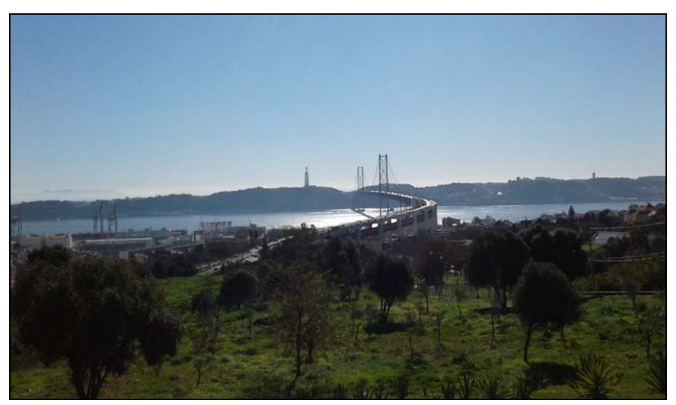
Figure 6. The 25 de Abril Bridge from the miradouro of the Bairro do Alvito

It was built from scratch to store and preserve dry cod and fresh fruit, with a structure of slabs and reinforced concrete beams designed to support the weight of these products. It was divided into 50 differentiated cold rooms and several food treatment areas, as well as warehouses, engine rooms, and even a gym for the workers. On the outer walls, panels with low-reliefs of the master Barata Feyo are preserved. It functioned as a cod warehouse until 1992, when it was closed down. Its requalification, by the architects Carrilho da Graça and Rui Francisco (with a landscape setting of Gonçalo Ribeiro Telles) was conceived to house the Museu do Oriente. The museum has six floors and basement, with two floors of exhibition area, reservations, auditorium and panoramic restaurant. It welcomes the art collection of the East Foundation and the private collection of the French sinologist Jacques Pimpaneau, made up of thousands of pieces of popular art from different Asian countries.