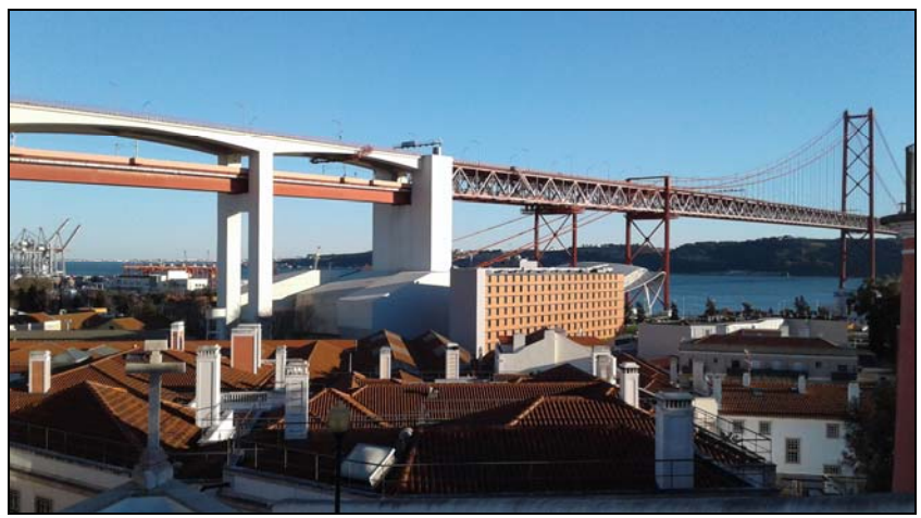
Figure 9. Overview of Alcântara neighbourhood

The multifaceted nature of the neighbourhood and the diversity of its resources correspond to various types of tourists interested in visiting it and possibly staying there: Traditional tourists, directed towards the restaurants of Docas and, in perspective, to Experiência Pilar 7, a future "great attraction"; Tourists belonging to the younger age groups, recalled by nightlife and the musical and cultural events taking place in the LX Factory and in the Village Underground; Explorers, searching for unusual or at least