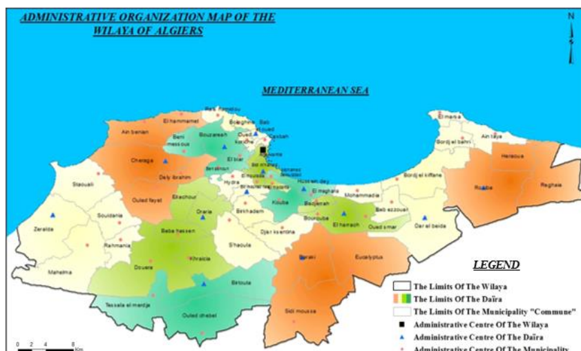
Figure1b. Geographic location of the study site