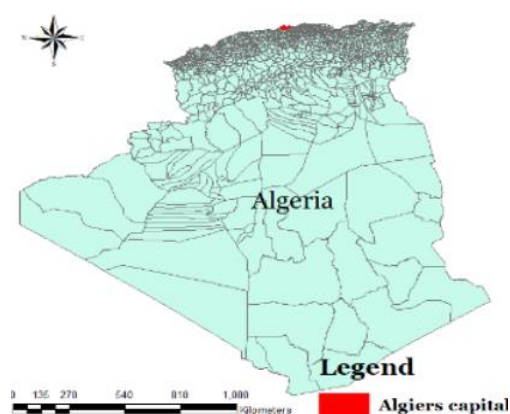
Figure1a. Geographic location of Algiers' wilaya (Chenki & Baaziz, 2020)

Algiers, capital of Algeria, is a territory with a natural site and an urban history. It occupies the heart of the northern region of the country with a surface area of 809.22 Km 2 , organised administratively into 13 Daïras grouping 57 Communes. It is situated globally on the strip limited by the Mediterranean Sea on the one hand and by the Tellian Atlas on the other. In terms of the shape of the natural site, it evolves around a crescent-shaped bay with two peaks, the Casbah and Tamenfoust. It is also a sloping configuration, with the lowest altitudes on the sea side. This is what gives Algiers this amphitheatre shape, with the coastal part as a stage, and the terraces which are the extensions of the city centre, and on the heights certain secondary centres of Algiers (Côte, 2006; ONT, 2011) (Figure1a and 1b).