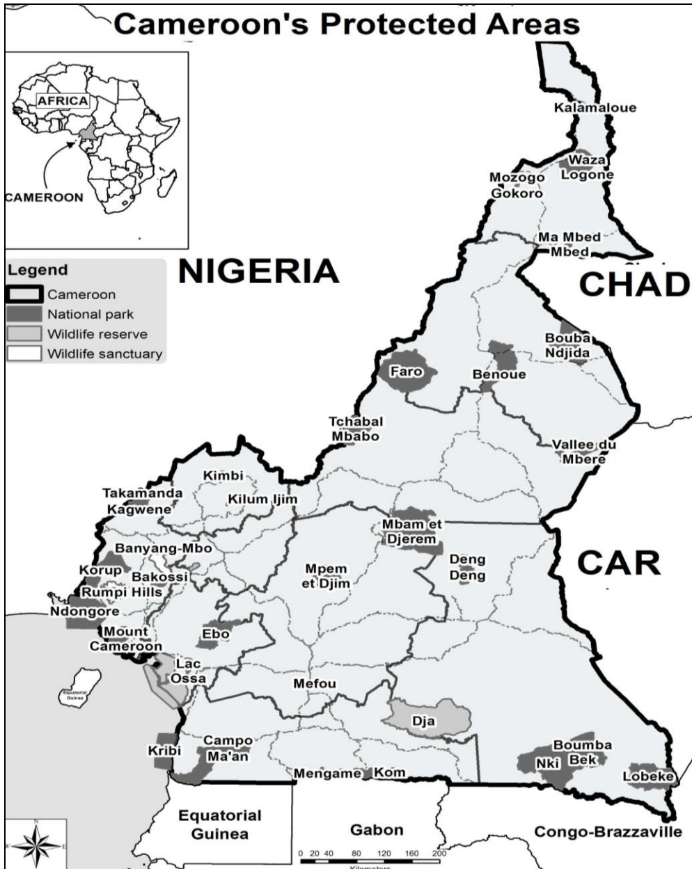
Figure 1. Geographical location of Cameroon and its protected areas

The appellation 'Africa in miniature' is used to describe Cameroon's topographical diversity which has given rise to the rich floral and faunal diversity found in the country. The country's location at the crossroads of West and Central Africa in the gulf of Guinea has given rise to a vast floral and faunal diversity and density.