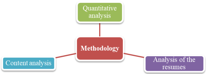
Figure 1. Used methodology for study the technologies of training specialists in the hotel and catering industry