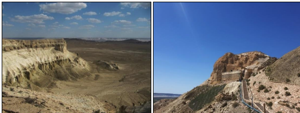
Figure 6. Ustirt chinks and the Becket Ata necropolis

of 21 kilometers from North to South and 9 kilometers from East to West. Boszhira's cosmic landscapes are composed of limestone deposits, once the bottom of the ancient Tethys Ocean, which existed over 10 million years ago. The huge valley-hollow is surrounded on three sides by an “amphitheater” of various landforms of white Cretaceous rocks - canyons, peaks, mountain-towers, mountain-castles (Figure 7).