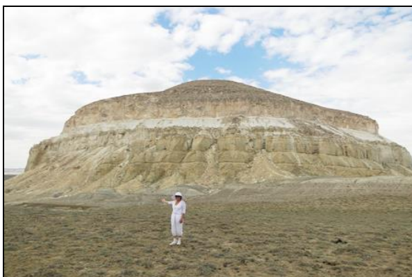
Figure 2. Mount Sherkala Geomorphosite

Mount Sherkala Geomorphosite. The territory of the geotope Mount Sherkala is located about 170 kilometers from the city of Aktau, 18 km from the village (Figure 2).