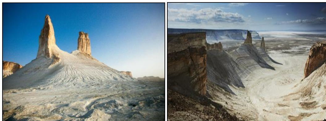
Figure 7. Boszhira Geomorphosite

Outlier mountains-chameleons also formed here, changing their appearance depending on the position of the sun and the time of day, a mountain-yurt, rocky gorges with steep walls, eroded chalk strata, stone nodules. At the bottom of the hollow you can find petrified shells and teeth of ancient sharks. A feature of Boszhira are two limestone peaks, about 300 meters (287 m) high, nicknamed for their form the “Azutister”, translated from the Kazakh “Fangs of Ustirt”. The peaks are cut by small ravines and beams, between which there is a narrow path along which you can climb to the observation deck from which a wide view of the Boszhira valley opens.