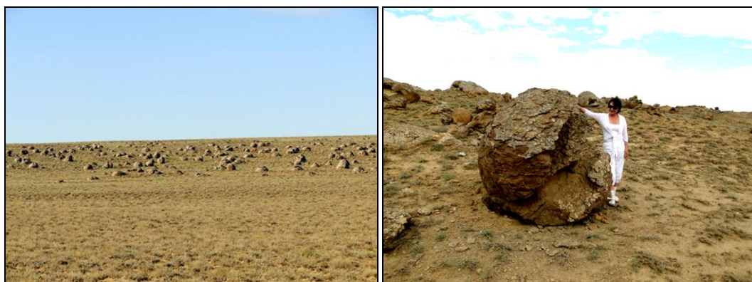
Figure 3. Torysh Geomorphosite

Shetpe to the north-west. In morphological terms, the table remains with a complex gully-relief relief. Mount Sherkala is a lonely standing mountain, of a very unusual shape. If you look at it from one side, the mountain looks like a huge white yurt