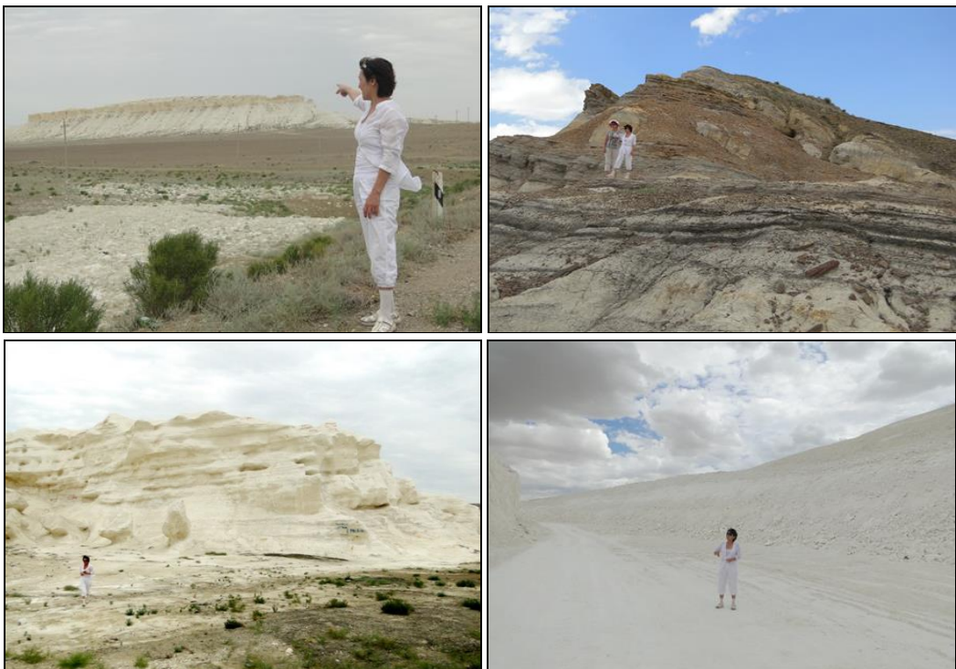
Figure 4. Mountain Mangyshlak Geomorphosites

Mangyshlak Mountain is represented by low ranges of the North and South Aktau, Western and Eastern Karatau. The Karatau ridges are composed of dislocated sandstones, mudstones, schists, Permo-Triassic limestones and conglomerates represented by large ridges with leveled or slightly wavy peaks and steep, sharply dissected slopes (Bekzhanov et al., 2000). The ranges are facing the Karatau valleys and rise above them by 100-200 m. The highest point of the town of Beshoky is 556 m, in East Karatau. Deposits of greenish clays at the foot merge with yellowish, pink, reddish clays or snow-white chalky outcrops; above they turn into yellowish-brown Sarmatian limestones. All of this is represented by a unique, layered formation, because the strata of deposits of unequal density and are susceptible to erosion in different ways (in particular, the layering of rocks is clearly visible on the coast). In Northern Aktau there is a unique place called "Akespe" (Figure 4). It is also called the "chess valley" because of the location of the rocks. The area is distinguished by a peculiar whiteness due to stacked rocks: limestones, marls and snow-white clays. Due to wind erosion, a typical type of relief has formed here, giving the area a beautiful landscape. The peaks of low snow-white mountains are cut by ravines and hollows. In the spring, during rain, stormy streams run along them, sometimes demolishing roads and settlements.